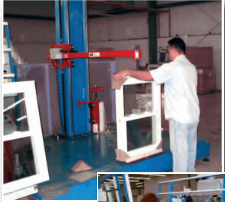
DETAIL CARE WRAPPING

Clear Choice USA is a "customer-centric" company: Customer satisfaction is our MOST IMPORTANT value.