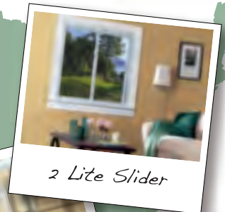
2 Lite Slider