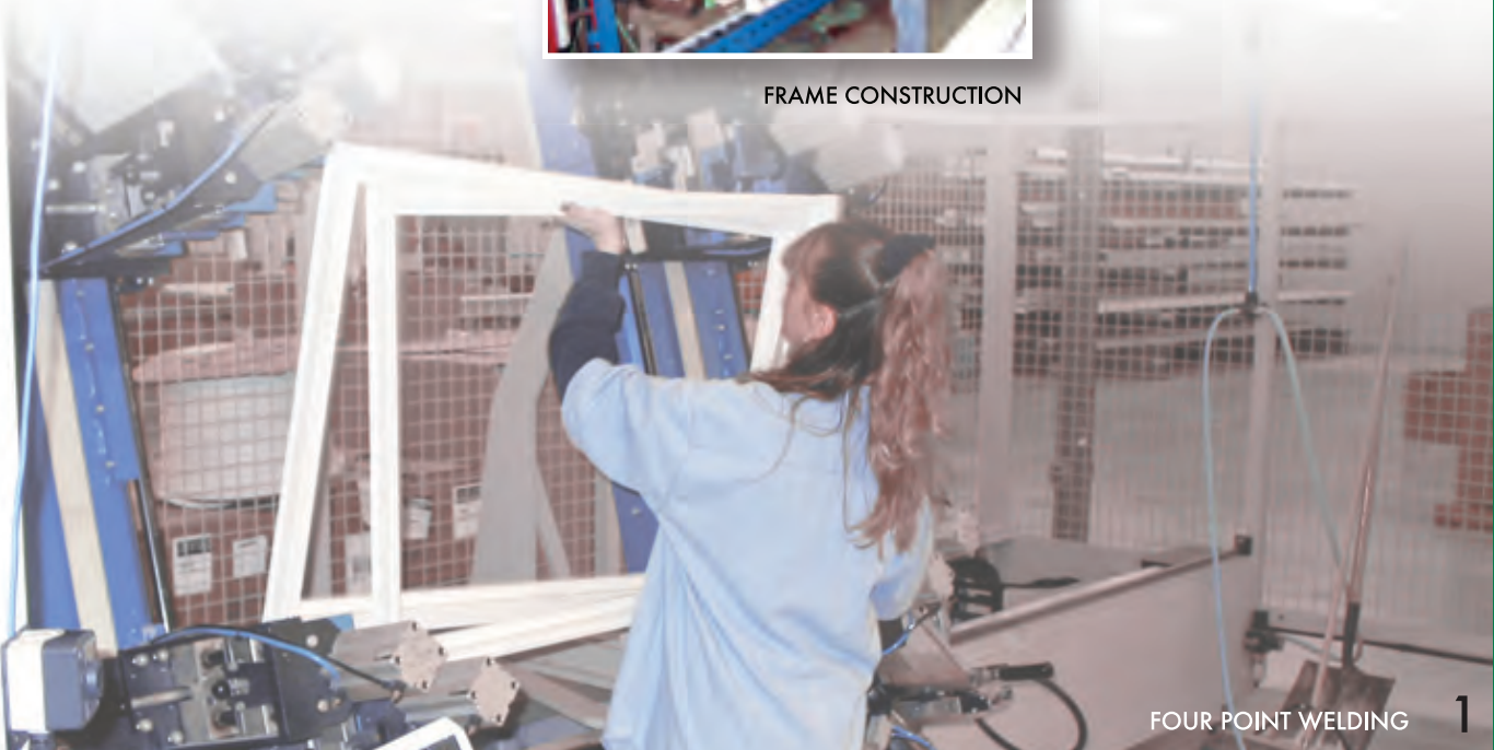
FOUR POINT WELDING