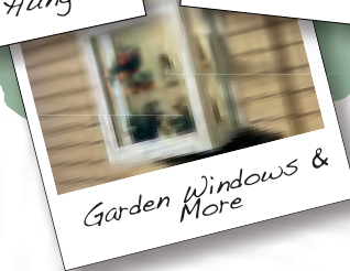
Garden Windows & More